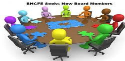
BHCFE Seeks New Board Members

The next Regular Council Meetings Wednesday, May 12 th & June 8 th , 2022 at 5:30 p.m.